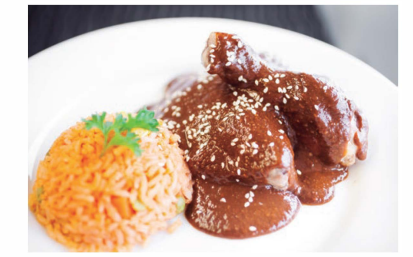
Pollo con Mole