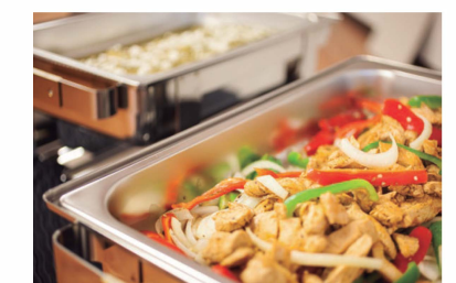
Fajitas de Pollo